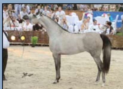
Lot 6 - Piacenza