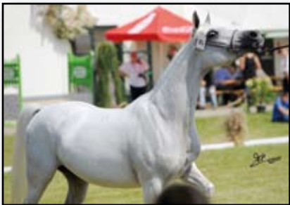
Lot 25 - Giralda