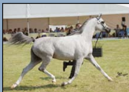
Lot 10 - Palabra