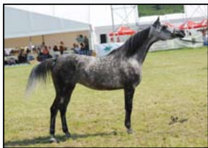
Lot 17 - Bohema