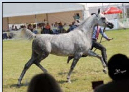
Lot 14 - Kashira