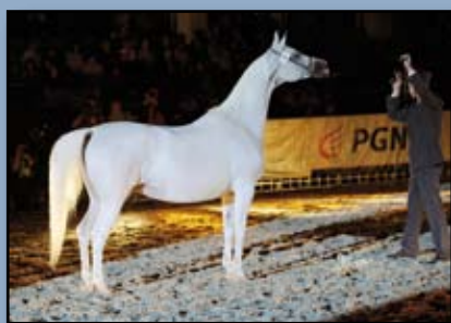
Lot 4 - Endorra