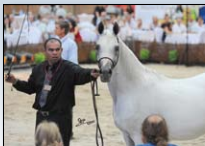
Lot 15 - Andaluzja