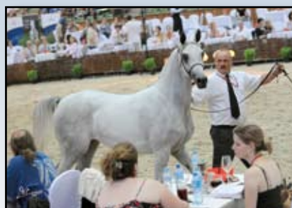
Lot 16 - Camilla