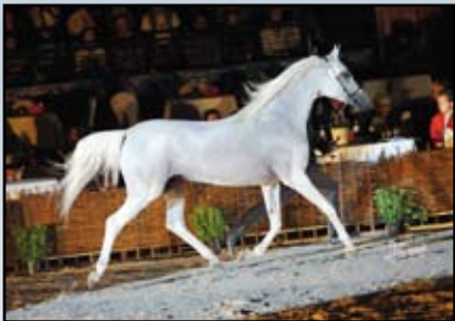
Lot 22 - Forminga