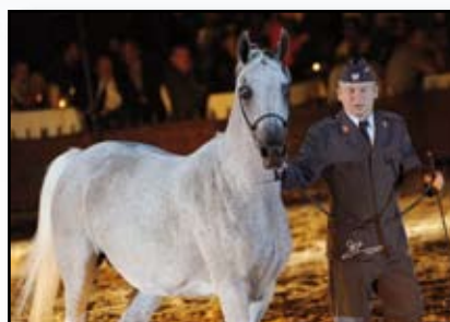
Lot 19 - Pohulanka