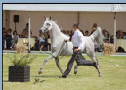
Lot 9 - Wieza Babel