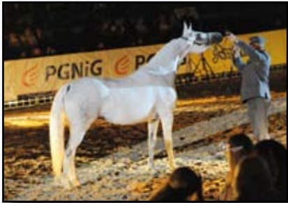
Lot 23 - Hulala