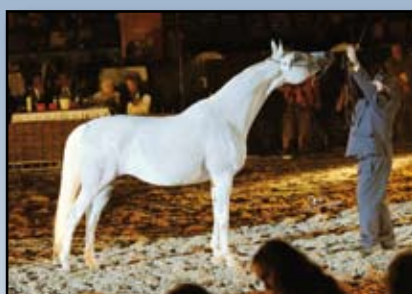
Lot 13 - Egzonera