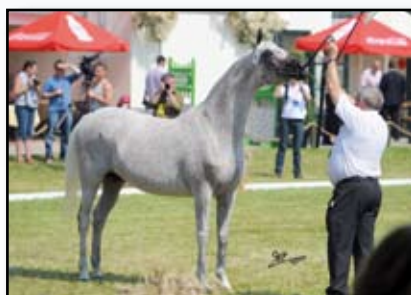
Lot 18 - Panika