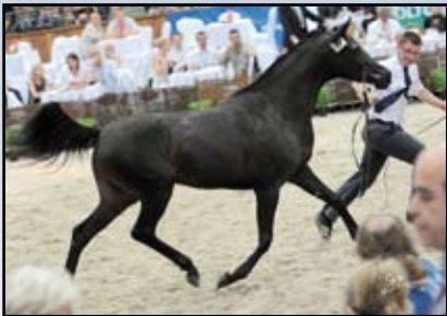
Lot 21 - Sarbia