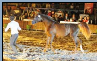
Lot B - Elmaran