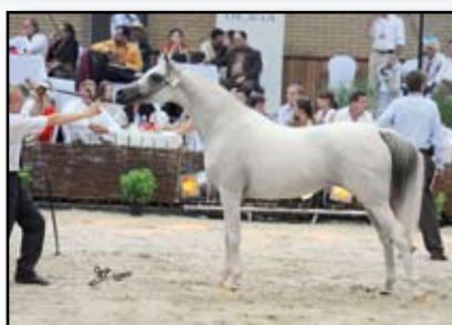
Lot 2 - Ehora