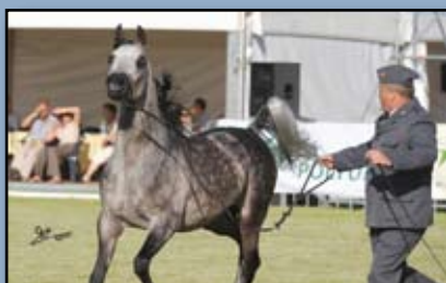
Lot A - Celsiusz