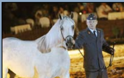
Lot 30 - Cetula