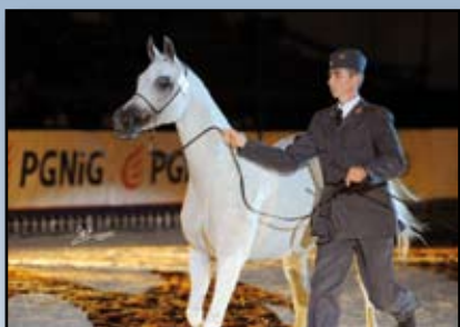
Lot 11 - Luanda