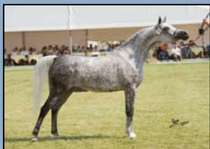
Lot 8 - Fabryazka