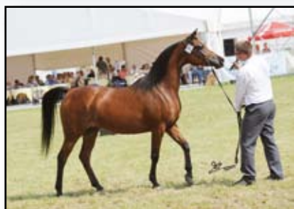
Lot 1 - Ekumena