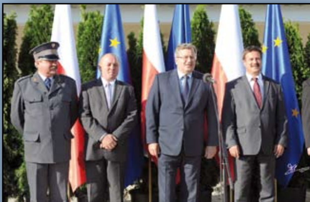
Visit of Polish President

13 year old EMMONA (Monogramm – Emilda/Pamir) from Michałów Stud, the World Junior Champion from Paris 2000, received the show's highest score – 94 points in class and two hours later the title of Best in Show. Emmo-na, looking like an absolute dream, had long waited for the title of Polish National Champion. But an Arabian mare is like wine... In this situation the numerously applauded, extremely typey EJRENE (Gazal Al Shaqab – Emocja/Monogramm), also from Michałów, had to settle for the Silver Medal. The Bronze shall remain at Janów Podlaski Stud due to the grey, dynamic ALABAMA (Gazal Al Shaqab – Altona/Eukaliptus). Missing the podium by a hair's breadth, but gaining a Top Five spot, was Michałów's WKRA (Gazal Al Shaqab – Wyborna/Monogramm).