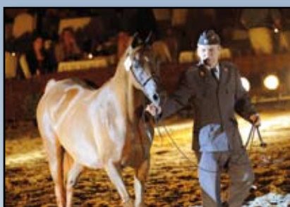
Lot 12 - Panonia