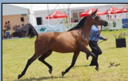
Lot 28 - Pasterna