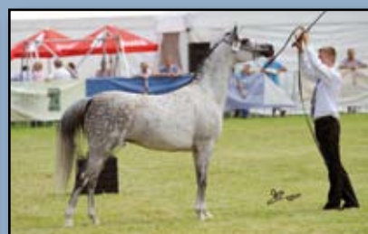
Lot 29 - Adelina