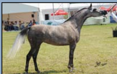
Lot 26 - Cisowa