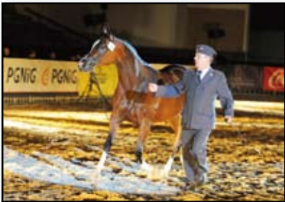
Lot 24 - Watra