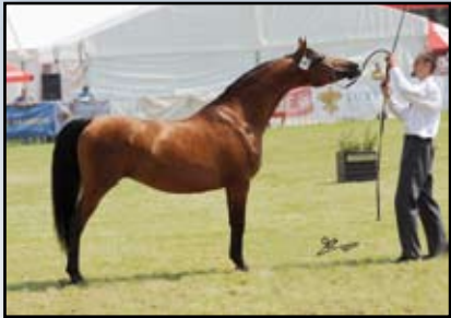
Lot 20 - Diaspora