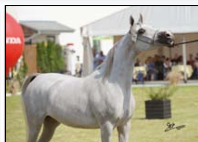
Lot 3 - Bajaderka