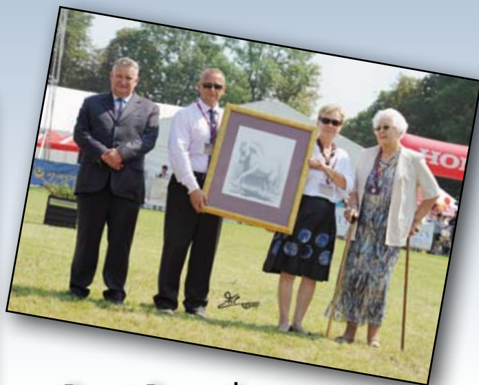
Best Breeder Michalów Stud